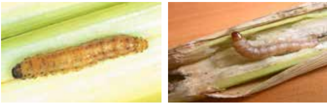
Summary of 2 trials showing the performance of ARENA 206 EC in controlling stalk borers ( Busseola fusca ) in maize