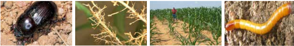
The effect of COUNTER FC 15G in the control of nematodes on the overall yield of maize (tons per ha)